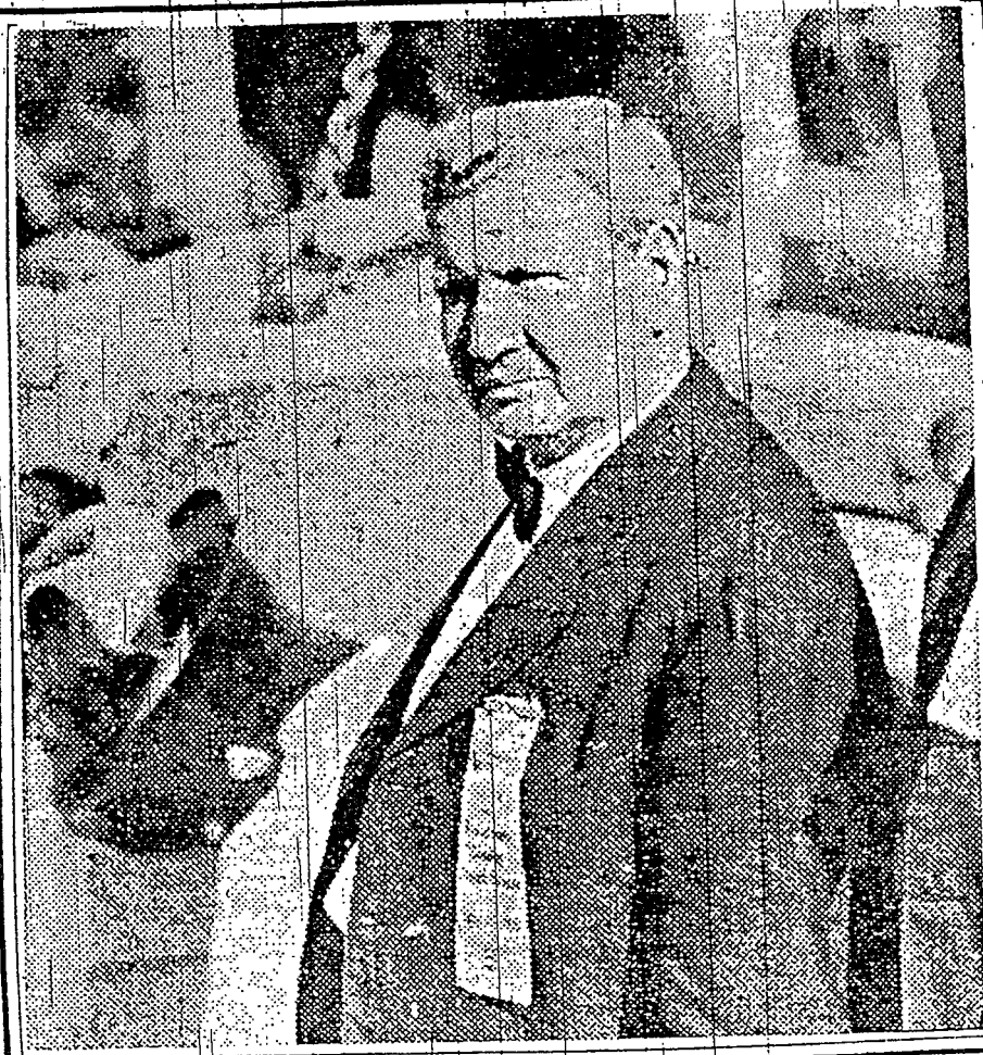
SECRETARY OF LABOR WILLIAM B. WILSON, JUST BEFORE BEGINNING ADDRESS OF DAY.

Secretary of Labor Wilson was the chief speaker Monday at the exercises of the laying of the cornerstone of Woodbury county's new courthouse, which is being erected at Seventh and Douglas streets.