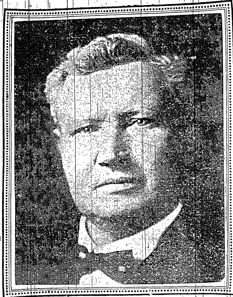
SECRETARY WILLIAM B. WILSON, Orator at Courthouse Ceremony.

Elaborate exercises will mark the laying of the cornerstone of Woodbury county's new half million dollar courthouse today. Outside of the actual placing of the block in place at the northwest corner of the structure, the ceremony attending the event will be held in the Auditorium.