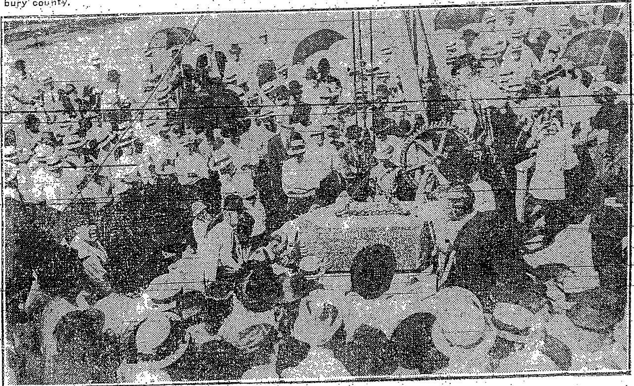
CROWD WITNESSES CEREMONIES.

ery ate be- ng ow he its a act ged by- vill m- de-