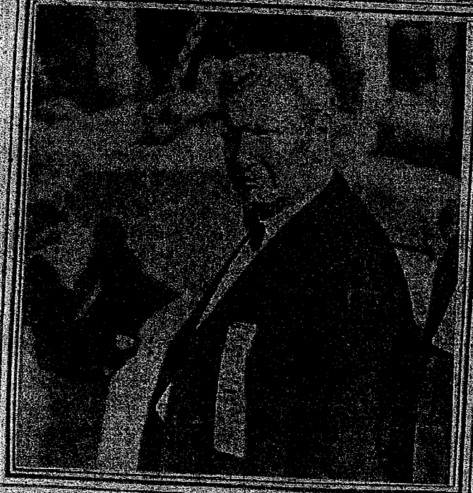
SECRETARY OF LABOR WILLIAM E. WILSON, JUST BEFORE BEGINNING ADDRESS OF DAY

Secretary of Labor Wilson was the chief speaker Monday at the exercises of the laying of the cornerstone of Woodbury county's new courthouse, which is being erected at Seventh and Douglas streets.