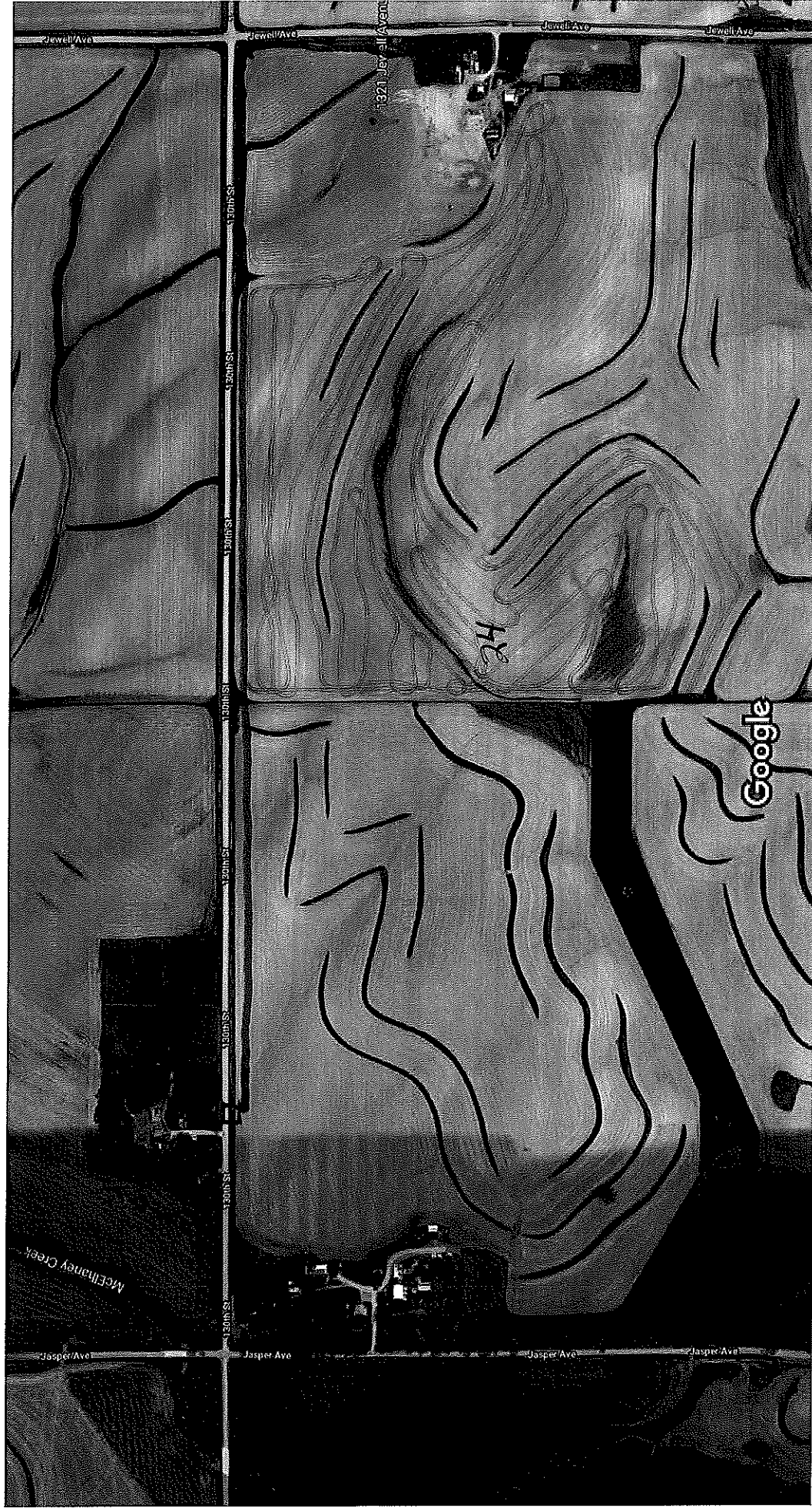
Imagery ©2019 Google, Map data ©2019 200 ft