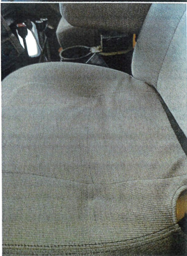
Truck number 200, fabric good, padding is gone and seat is down to steel backing.